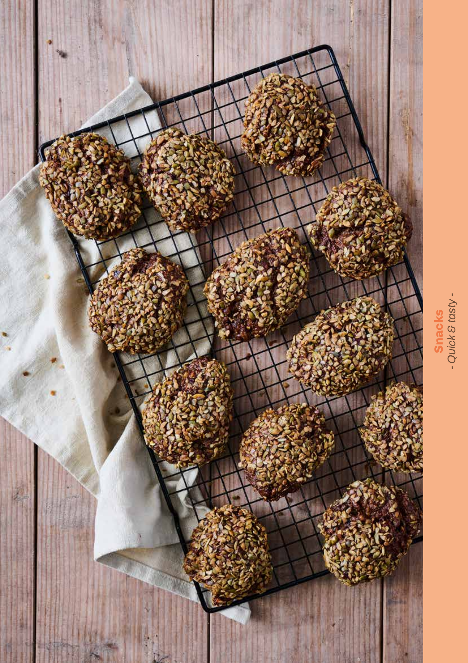
Snacks - Quick & tasty -